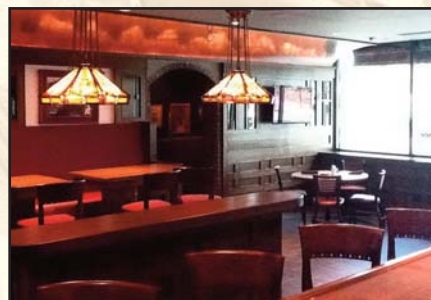
ENTRANCE FROM LOBBY