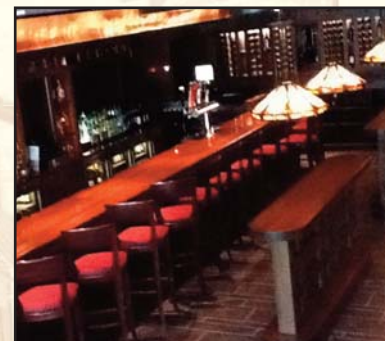
FROM THE NEW UPSTAIRS LOFT, Just Kidding - me standing on window ledge.